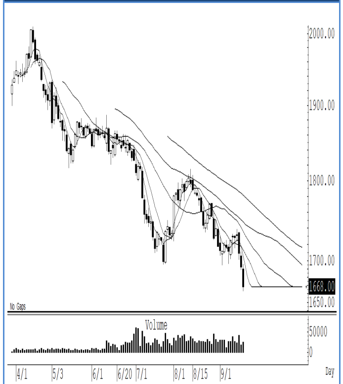
GOU22 (Close 1,668.00 Chg -24.20)

ราคาทองคำโลกปรับตัวลงทำจุดต่ำใหม่ตามคาด สั้น ๆ ติดกลับไม่ผ่าน 1,685 ดอลลาร์ แนวโน้มน่าจะทำจุดต่ำใหม่ไปเรื่อย ๆ แนะนำ trading ในกรอบระหว่าง 1,685-1,640 ดอลลาร์ รับรู้กำไร หรือในกรณีที่เปิดต่ำกว่าระดับ 1,640 ดอลลาร์ แนะนำ ถือ short หวังผลปรับตัวลงไปแถว ๆ 1,520 ดอลลาร์ รับรู้กำไร